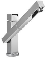
Mixer Tap Twix Plus 8427 020